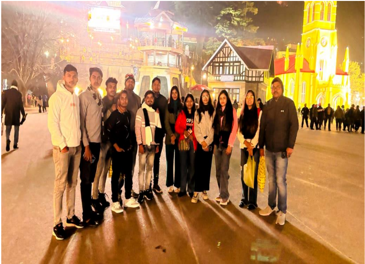
B. Pharm, 8 th sem students at Mall road, Shimla