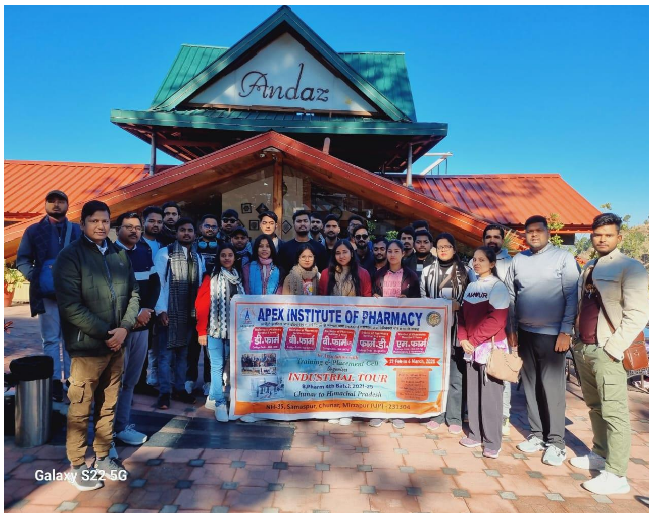
B.Pharm, 8 th sem Students standing in Shimla hotel