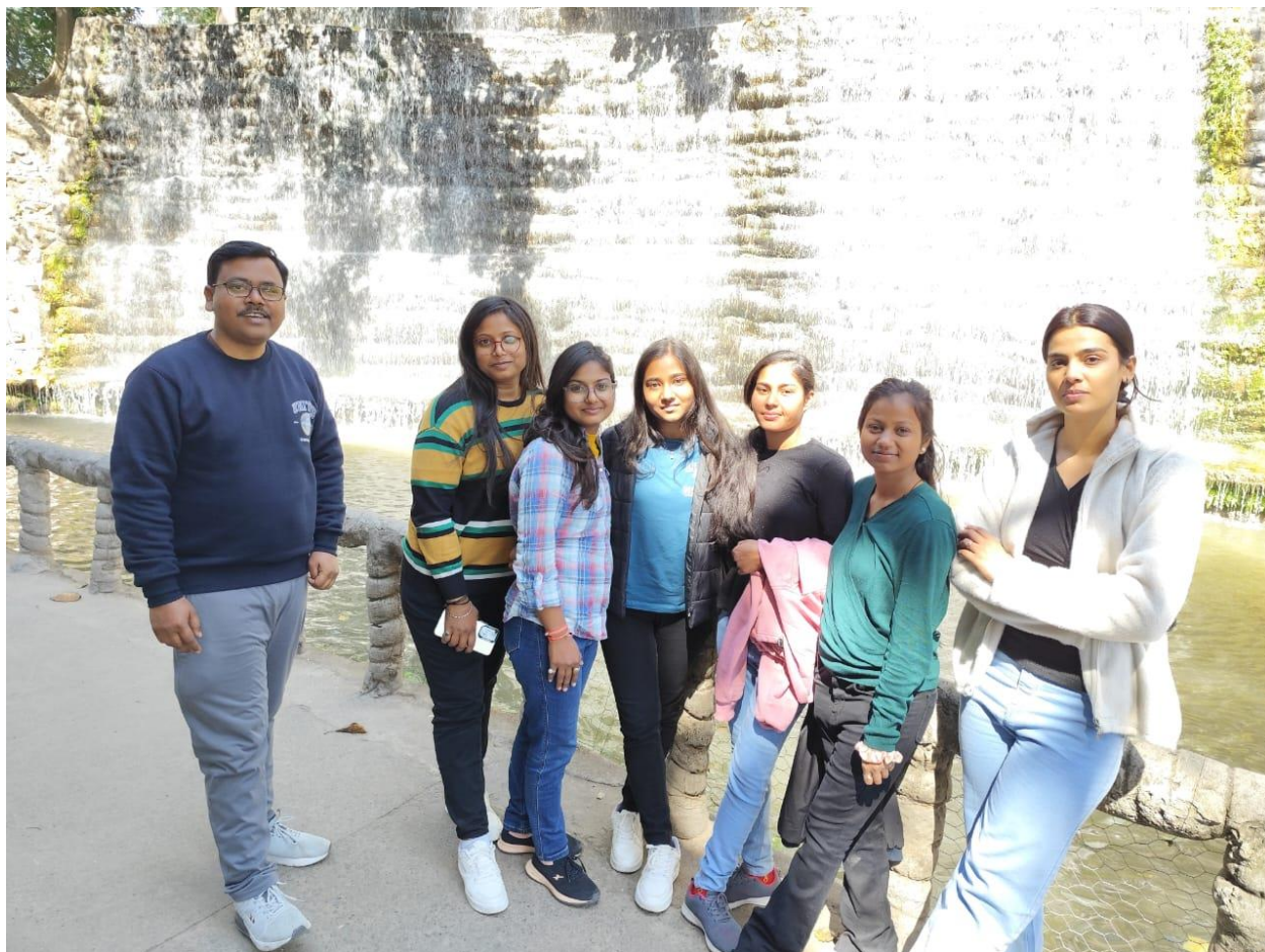
B. Pharm, 8 th sem students at Rock garden