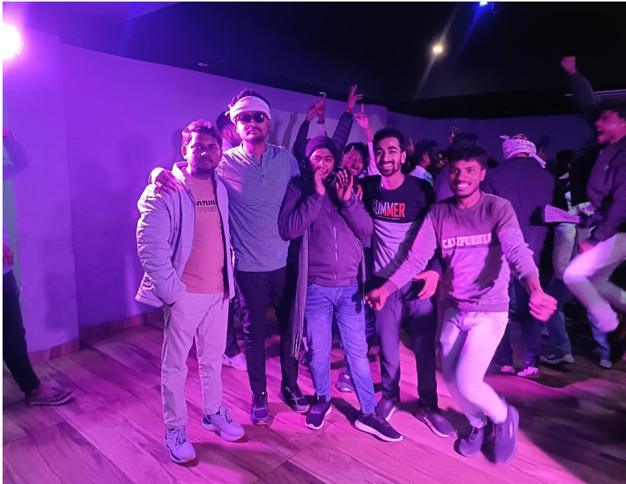
B. Pharm, 8 th sem students at Manali DJ Night