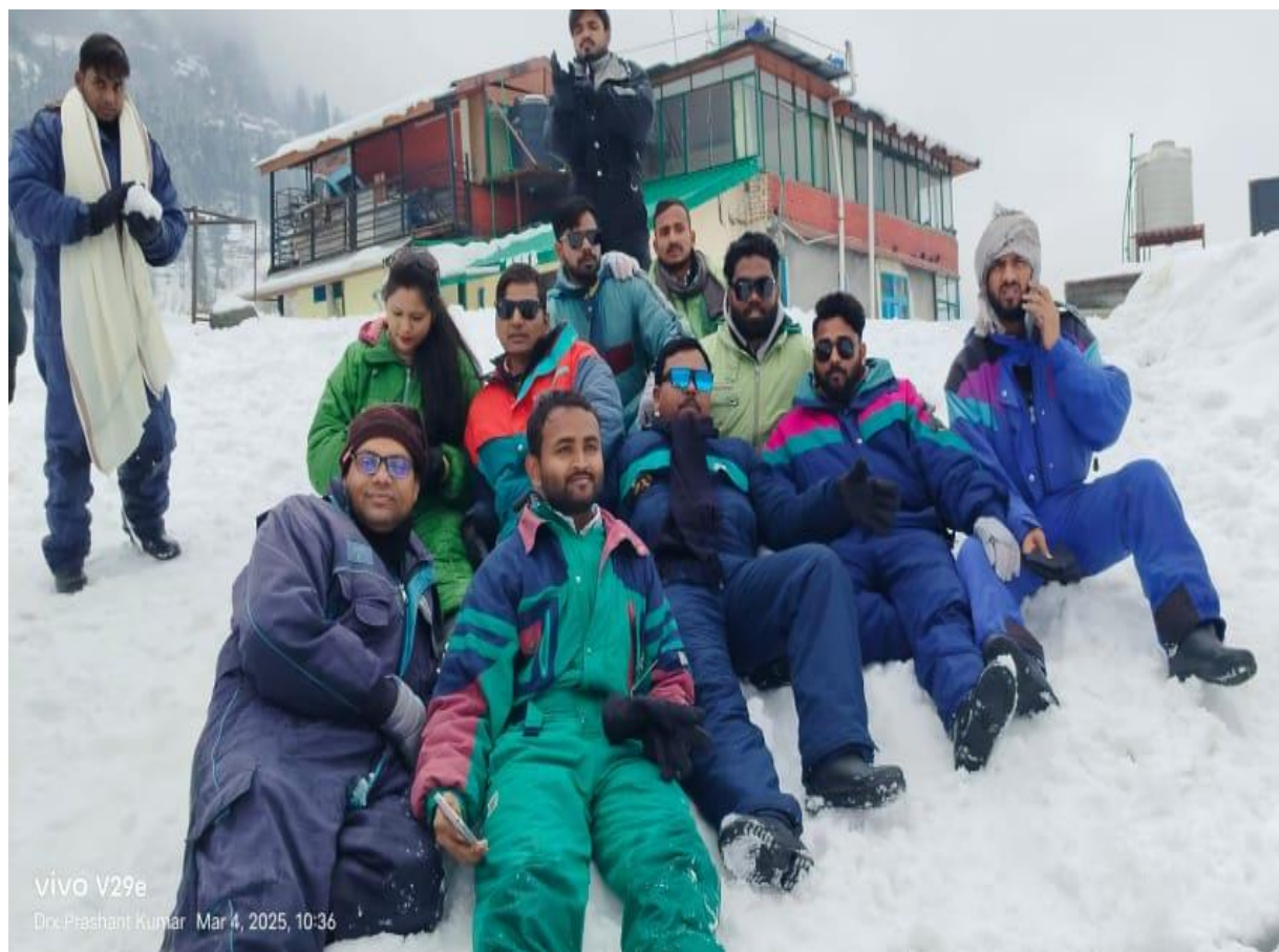
B. Pharm, 8 th sem student enjoying snow at Manali