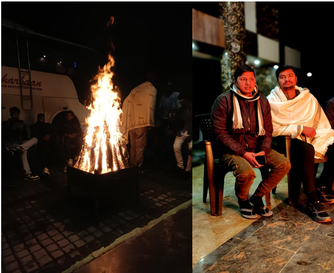
B. Pharm, 8 th sem students enjoying Bonfire in camp at manali