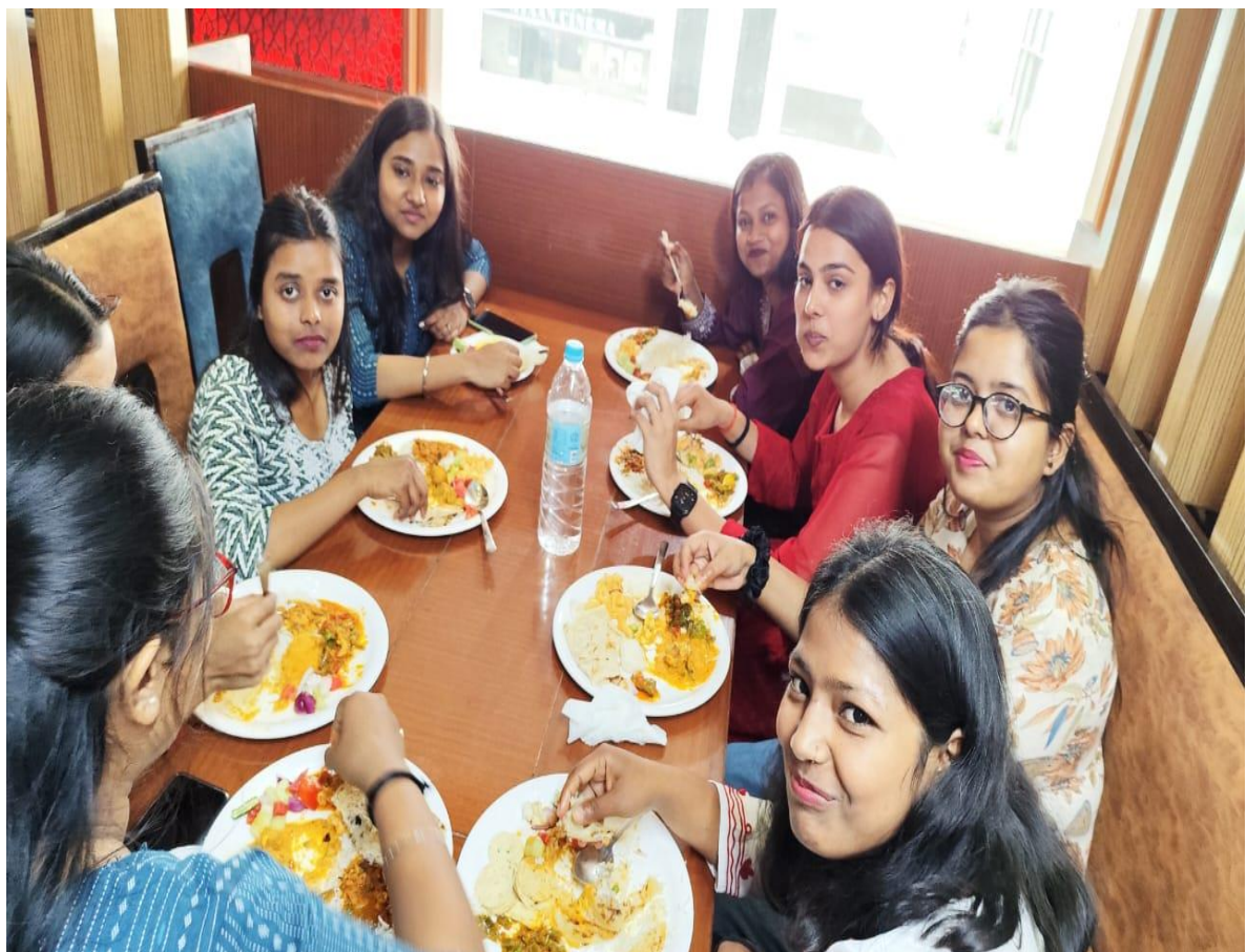
Lunch in hotel