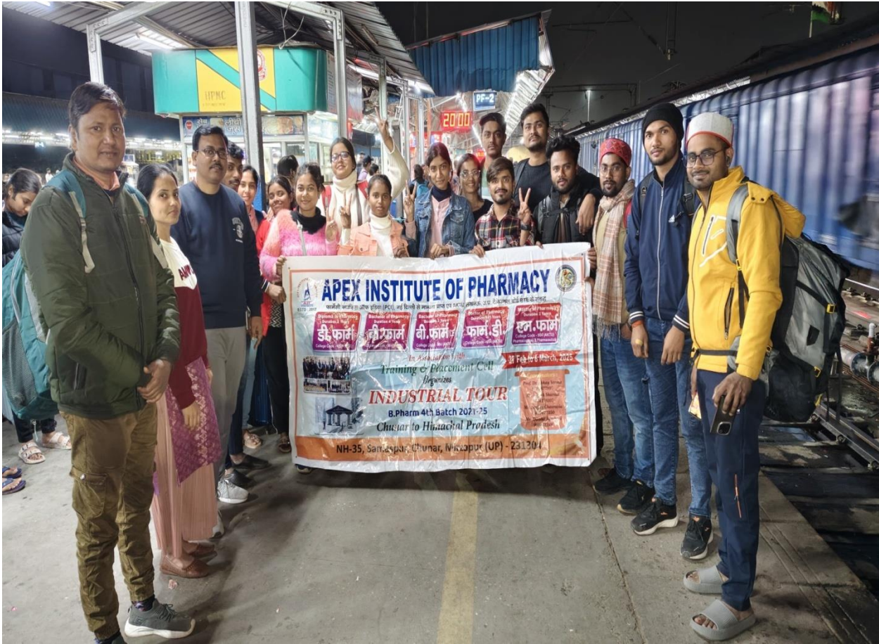
At Amabala Cantt railway Station