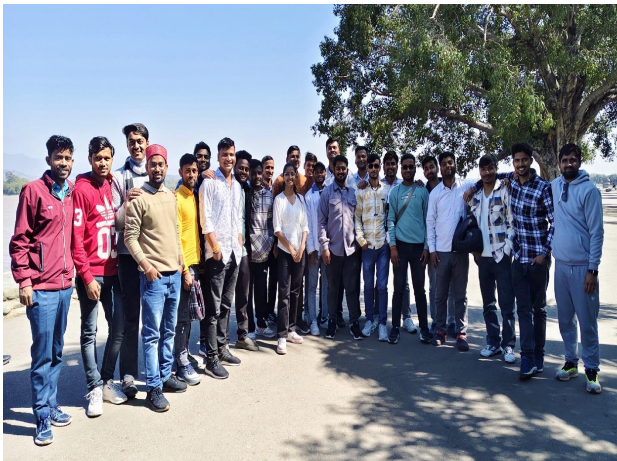
B. Pharm, 8 th sem students at Shukhan lake