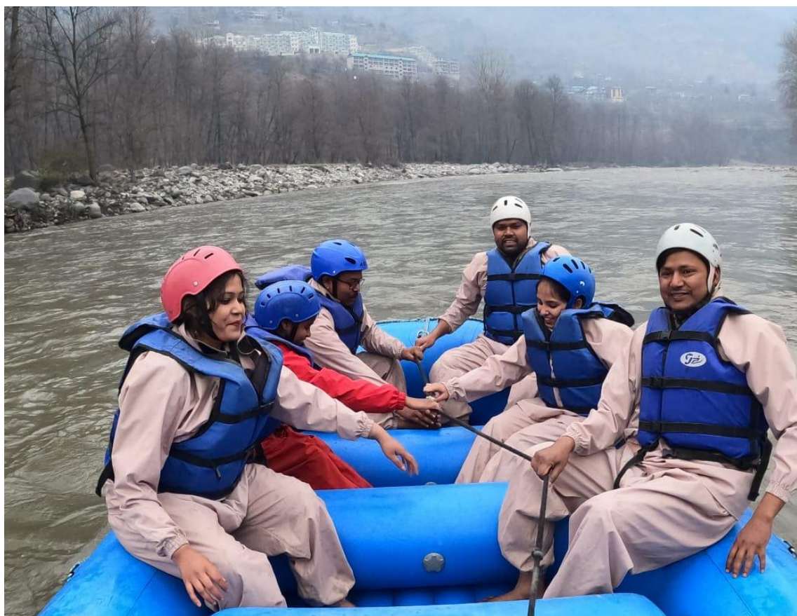
B. Pharm, 8 th sem students enjoying River Rafting