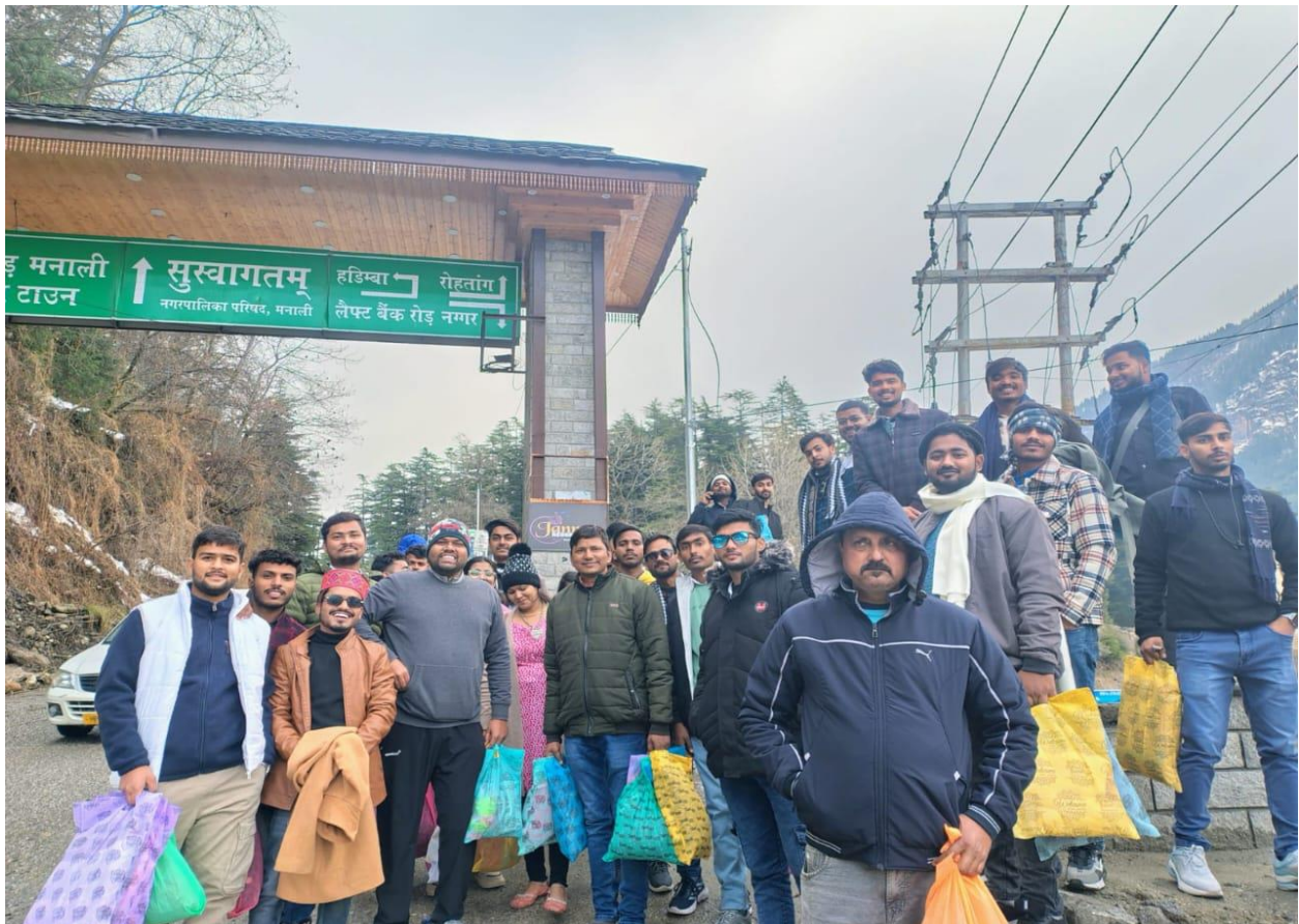
Manali Mall Road Shopping